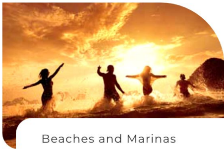
Beaches and Marinas