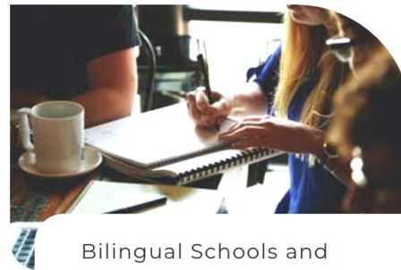
Bilingual Schools and Universities