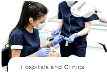
Hospitals and Clinics